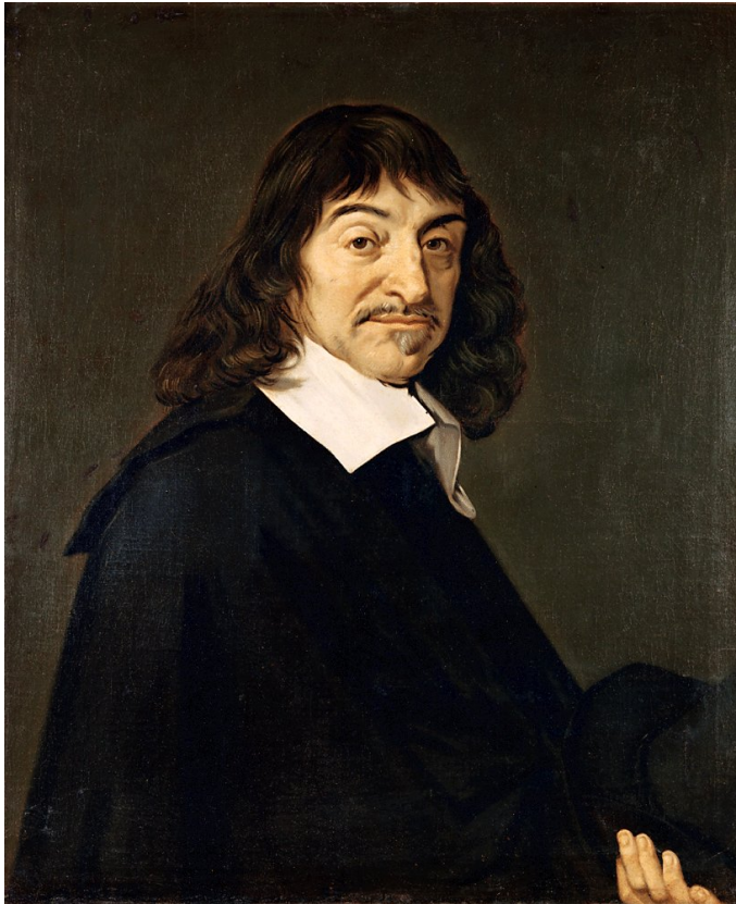
THE MECHANICAL PHILOSOPHY