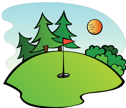
Figure 2: “Golf Course” by pianoBrad is available in the Public Domain .

The first task was inspired by a “Code Golf” challenge: Convert numbers to dice patterns .