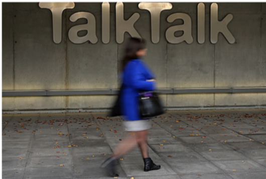
A woman walks past a company logo outside a TalkTalk building in London, Britain October 23, 2015.